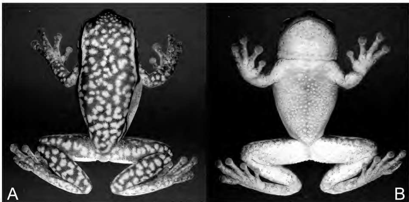
Fig.1- Phyllodytes maculosus sp.nov. (holotype, MNRJ 41669, SVL 21.6mm). (A) Dorsal and (B) ventral views.

kautskyi , P. luteolus , and P. melanomystax (all have a immaculate dorsal color). The remaining species of the genus show some different kind of dorsal pattern: P. auratus and P. wuchereri have longitudinal stripes; P. gyrinaethes has variable marbled dorsal pattern; P. punctatus and P. tuberculosus present distinctive brown dots. Phyllodytes maculosus sp.nov. is close to P. kautskyi by the size (SVL 39.7-43.5mm in males, 48.5mm in female of the new species and SVL 38.0-42.0mm in males, 43.5mm in female of P. kautskyi ). The other species are smaller (SVL in males ranging from 18.2mm in P. punctatus to 35.0mm in P. auratus ). The rounded snout in dorsal view separates P. maculosus sp.nov. from P. acuminatus , P. auratus , P. luteolus , and P. wuchereri (acuminate snout). Moreover, in profile, the vertical snout distinguishes P. maculosus sp.nov. from P. acuminatus , P. auratus , P. brevirostris , P. edelmoi , P. gyrinaethes , P. luteolus , P. tuberculosus , and P. wuchereri (snout acute or protruding). However, P. kautskyi , P. melanomystax , and P. punctatus also present vertical snout in profile. Phyllodytes maculosus sp.nov., P. acuminatus , P. gyrinaethes , P. luteolus , P. tuberculosus , and P. wuchereri present on each side of the mandible two large anterior odontoids differing from P. auratus , P. edelmoi , P. kautskyi , and P. punctatus (one larger odontoid), whereas P. brevirostris and P. melanomystax have no large odontoid.